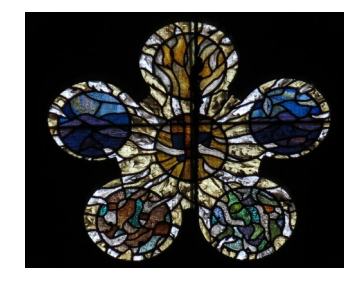
The Millenium Window at St Peter's Church, Kington Langley