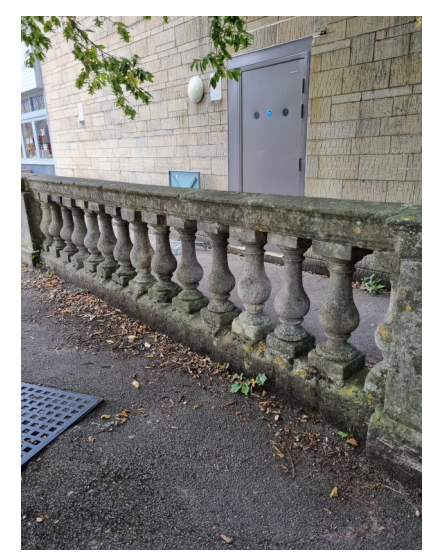
All that remains of the parapet of the Chippenham Town Bridge demolished in 1966 - situated next to the Rivo Lounge Café Bar