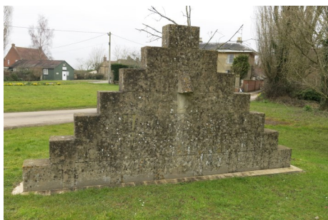
Sundial at East Tytherton inspired by the Ziggurat pyramids of the Middle East

The Bremhill Parish website ( bremhillparishhistory.com ) has details of how to obtain a copy. It is also available from Chippenham Museum and the Chippenham branch of Waterstones, priced £20.