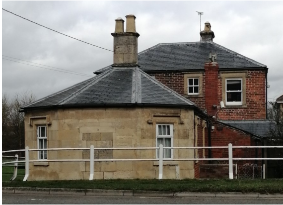
Toll House on the corner of Stanley Lane and the A4 London Road, Chippenham Built c.1835 The original doorway has been blocked in.