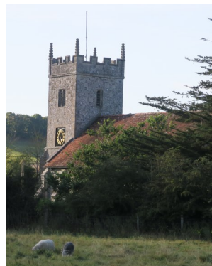
St Lawrence Church, Stratford-sub-Castle

A provisional date has been set for the talk—Wednesday 25th May at 7.30pm. Details for the walk and booking instructions will be released soon.