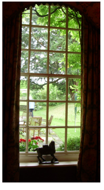
Window view of the garden at Odstock Manor.

Afternoon tea was a delicious selection of miniature cakes and sandwiches.