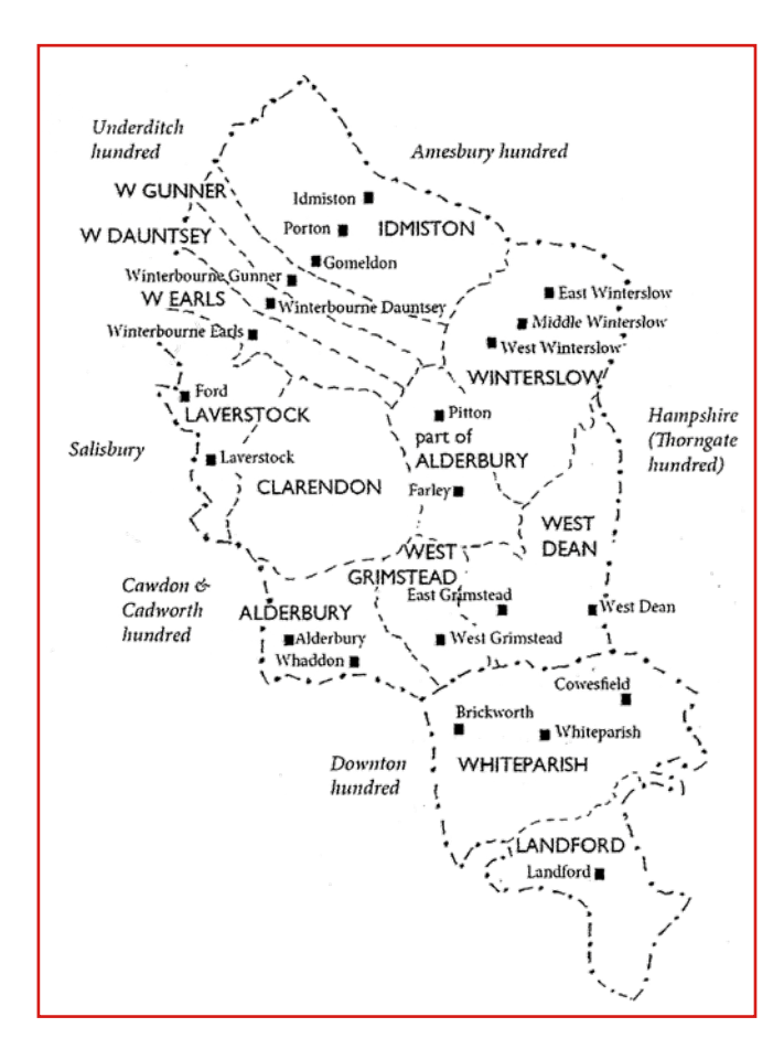
Above: The areas to be covered by volume 21.

Gift aid, which is available if you pay income tax and the donation is not made from a charitable trust, is valuable both to us (allowing us to claim back the tax you have paid) and to you (by offsetting your liability to higher rate tax). The fourth section of the form is a gift aid declaration.